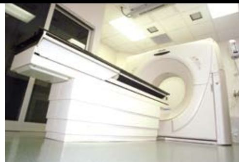
Large Bore CT Simulator

The benefit of the large bore over a traditional CT Simulator is the larger field of view for doctors and other clinical specialists, allowing patients to receive a more comprehensive scan. The CT Simulator is used with IMRT, stereotactic radiosurgery, HDR/MammoSite and 3D treatments. This equipment is just another way Mercy provides quality cancer care for the people of the North State.