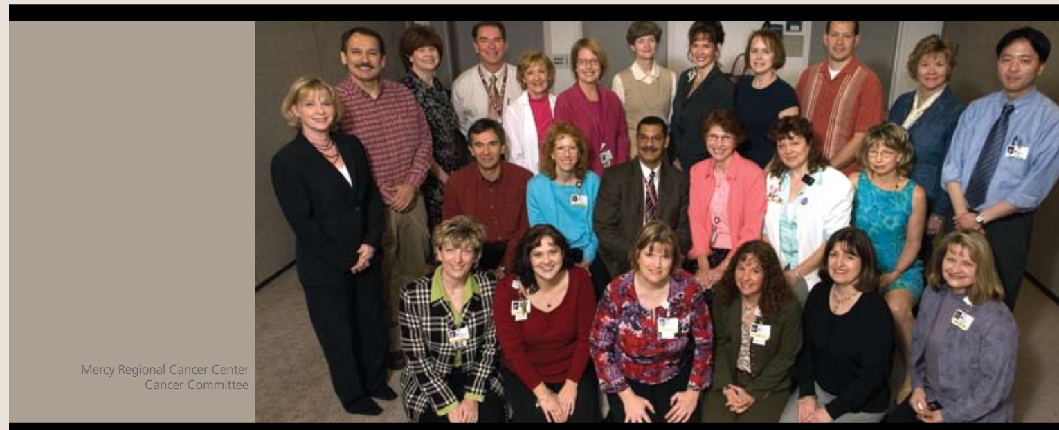
Mercy Regional Cancer Center Cancer Committee