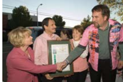
Think Pink morning, 2007